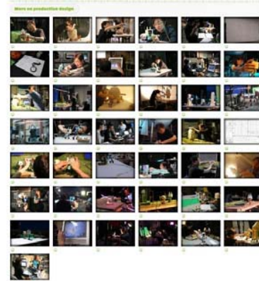
The "PLUG, OUR NeW WORLD" animation-making site